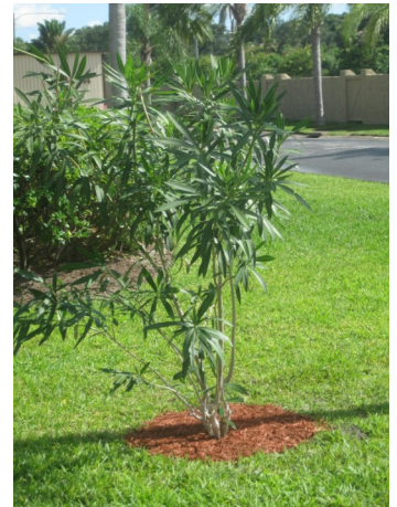
A view of the new oleander tree now living west of Building 13.

We have also replaced the queen palm that was removed from in front of 1404.