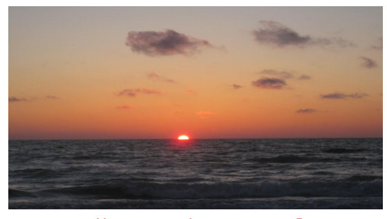
Missing our glorious sunsets?

I am reminded of a verse that I heard in China — "We are all teachers," and we are all students".