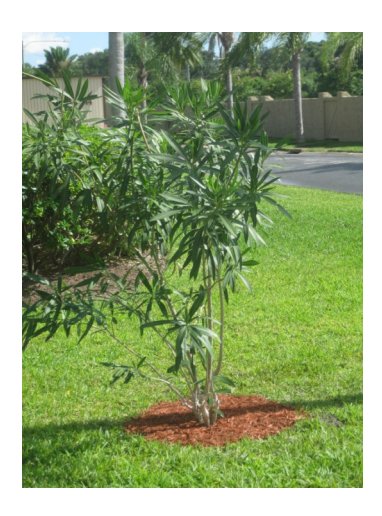
A view of the new cleander tree now living west of Building 13.

We have also replaced the queen palm that was removed from in front of 1404.