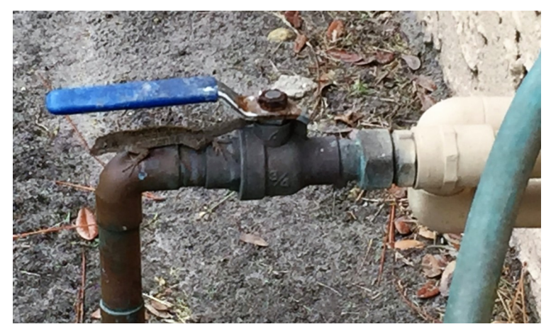
Even our lizard friends escape from the hot Florida summer sun.